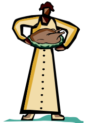
Time to be Thankful